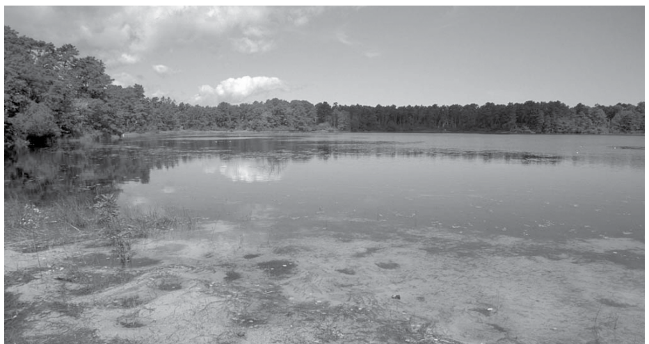
The Grassy Pond, a globally rare coastal plain pond.

PayPal Is now available at the Orenda Website just search for Orendalandtrust.org to renew your membership or make a donation with PayPal the most trusted credit card site. Your financial security is our highest priority.